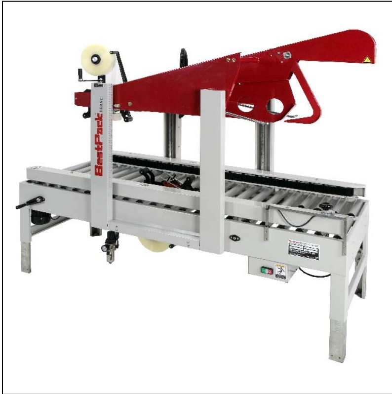
AS Automatic Uniform Sidedrive